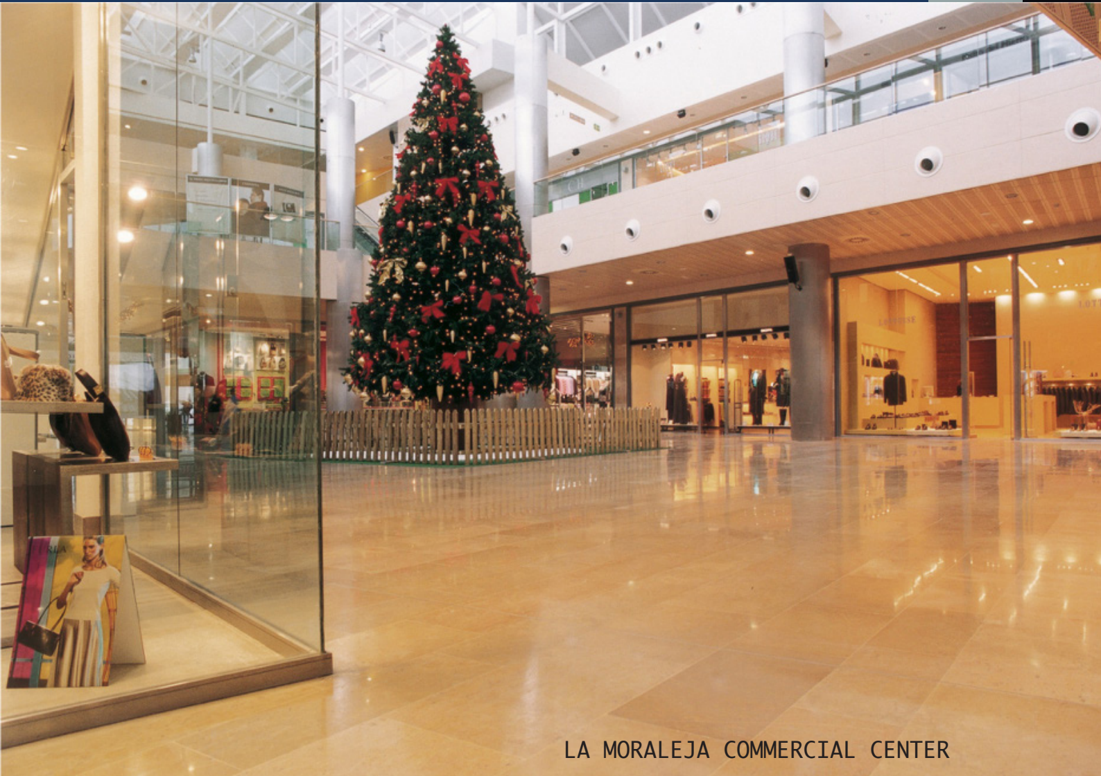
LA MORALEJA COMMERCIAL CENTER